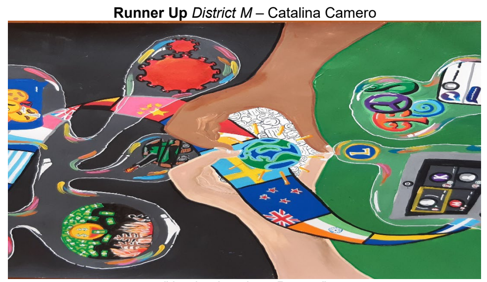
"Justice Leads to Peace."

"We are all connected, like branches on a tree. We must work together, not just as you and I but as humanity, to spread the roots of peace and harmony and nurture our connection to the world and each other, no matter our race and religion."