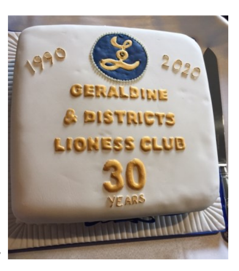
Celebration of 30 years as a Lioness Club