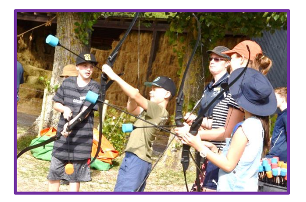
Archery with soft points were great fun