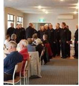
Singers are the "Southern Sounds"