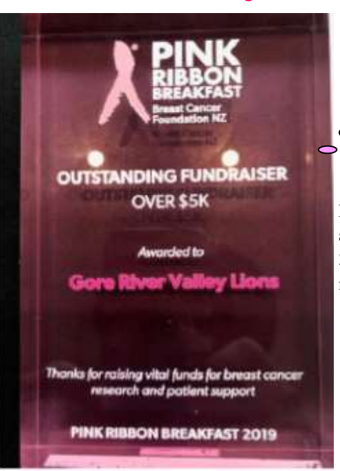
Awarded to Gore River Valley Lions for the Pink Ribbon Breakfast