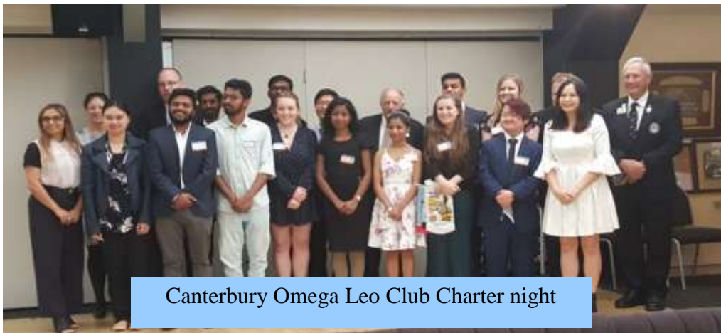
Canterbury Omega Leo Club Charter night