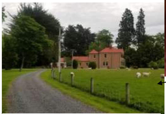
Why did we drive into to this property