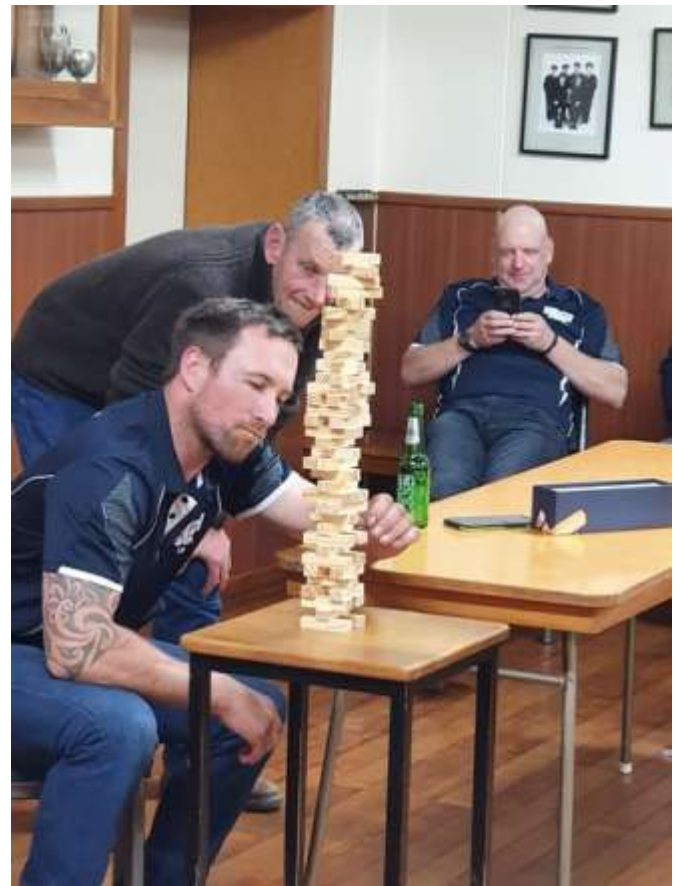
Member taken part at the Fire Brigade games challenge