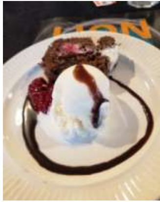
It was yummy