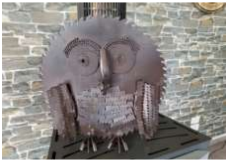
Some Lion parents have very clever family members