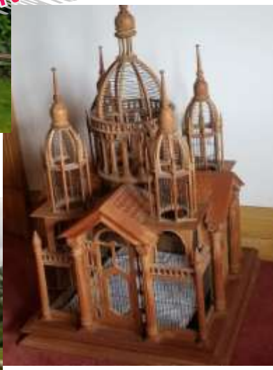
Seen in this Property