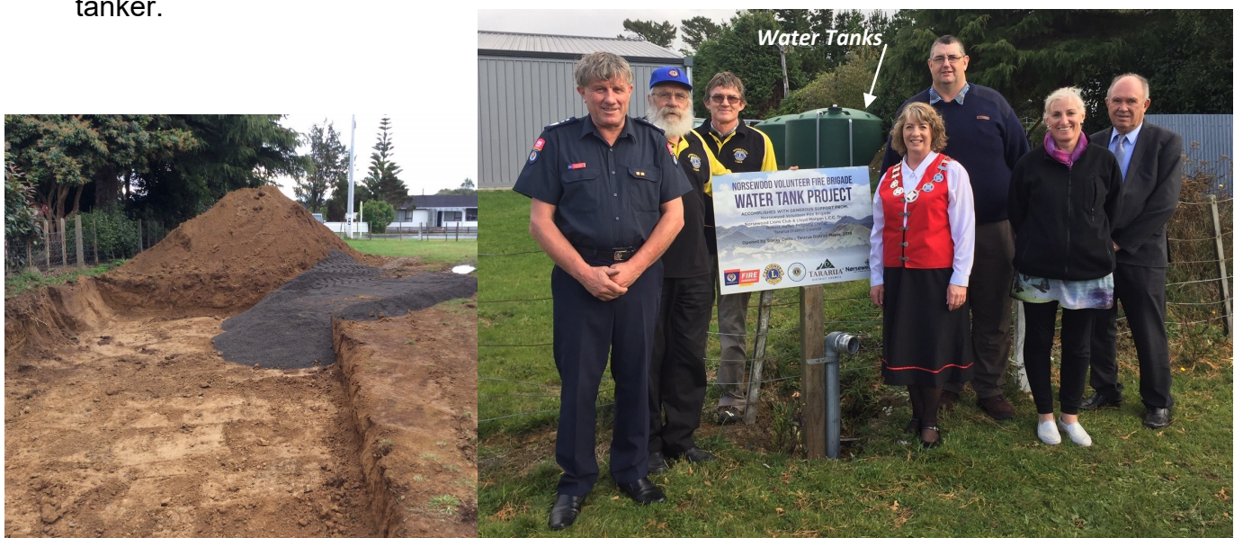
Taken on-site at Norway Day celebrations on 19 May 2019

Tararua District Council for supplying coupling and preparing the area to park the water tanker.