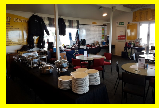
View club rooms and prize table.