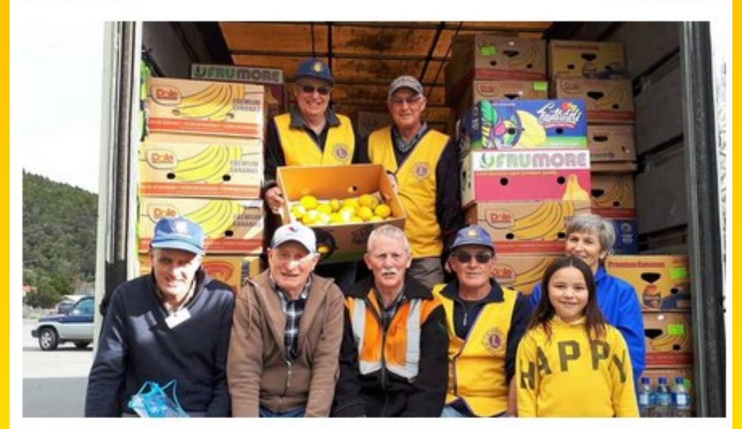
Lions club members organised the Citrus for the South campaign that saw 225 boxes of fruit donated. Christchurch and Dunedin will be getting a healthy boost of Vitamin C thanks to generous Northlanders who donated boxes of fruit for the Citrus for the South campaign today.

Mandarins, limes, lemons, grapefruit and more zesty fruits will soon be on the road to the southern cities, where citrus is not grown, after a collection day organised and run by Whangārei's Lions Clubs.