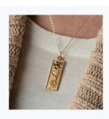
10K Gold Flower Pendant US$234.95 Chain sold separately