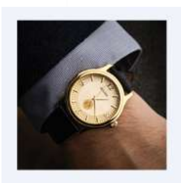
Men's Bulova Watch US$112.95