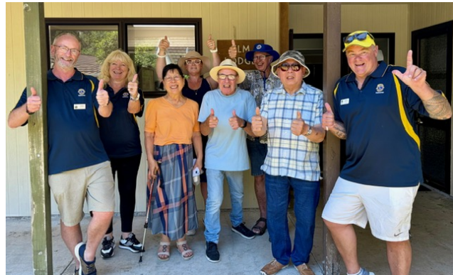
Were we impressed? Absolutely!

A small group of Lions were privileged to be invited to visit and witness this year's camp (officially the Diabetes NZ Wellington Youth Camp) staged at the El Rancho Camp & Conference Centre on the Kapiti Coast. The camp is a safe environment, designed to ensure all campers are cared for with the utmost care and attention, professionally supervised by a regime of Youth Leaders, many of whom also live with Type 1 diabetes themselves and thus able to provide relatable mentorship and support.