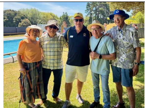
Sadly, it was time to bid farewell to what has been an inspiring opportunity to witness the camp first-hand.

Significant financial support for this year's camp was provided by the Lions Club of Johnsonville, matched by an equal donation from Heads Up for Kids (HU4K) whose support is gratefully acknowledged.