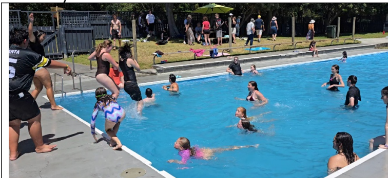
More joyful fun – Kids being kids, but always supervised and carefully monitored by rostered activity leaders.

Diabetes NZ Youth Camps are a game-changer for all involved in a game of life that no-one enters voluntarily.