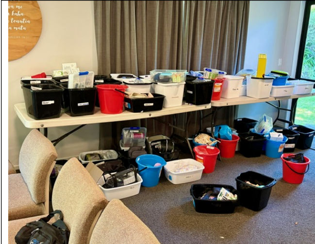
Every camper has their own named and documented personal supplies to attend to their individual medical needs.