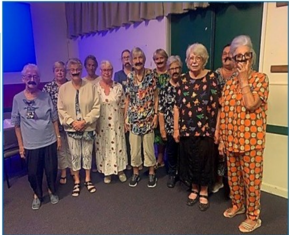
The Programme Committee also distributed moustaches to members which, though not particularly flattering, sparked lots of laughter