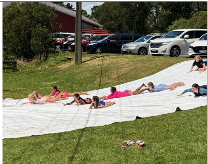
Screams aplenty and squeals of delight as soaped-up campers slide down the slippery slope.

Impeccably documented procedures, continuous improvement methodology, coupled with the transfer of personal knowledge year by year ensures that all attendees are safely managed and cared for, whilst simultaneously providing a fun-filled stimulating environment for children who do not enjoy "normal" health to be "normal" together.