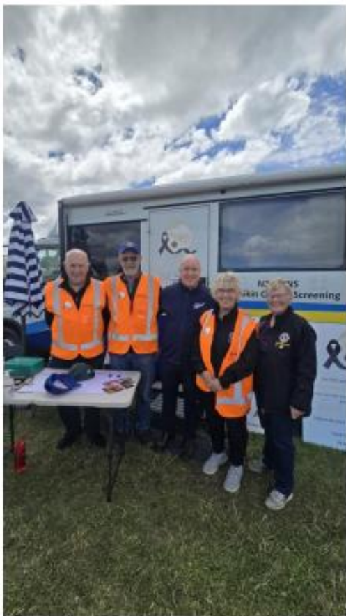
Prime Minister Chris Luxton visits the Cancer Vehicle at the Gore Field Days.

Thank you to those clubs who have made a contribution to this NZ Lions project. To date we have had over 267 donations from Clubs and individuals