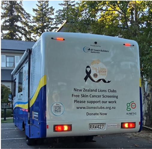
Caught the eye of the PM while at Southern Field Days.