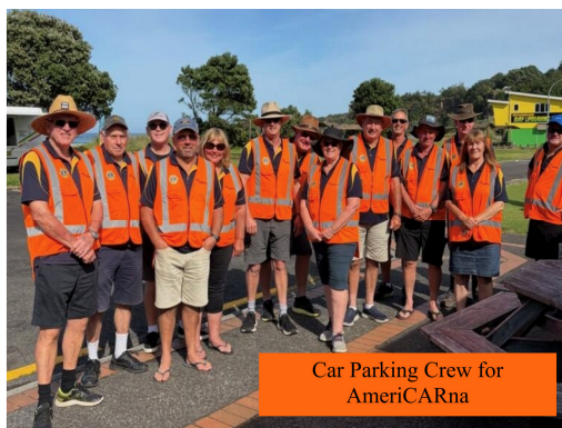
Car Parking Crew for AmeriCARna