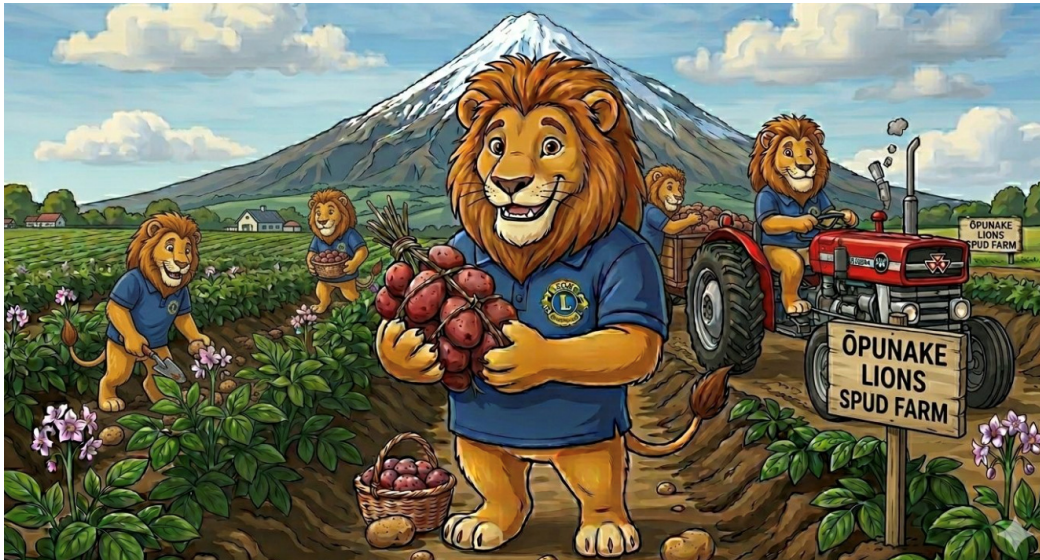
(Image courtesy of Opunake Lions Facebook page - AI generated ie. not real lions!)