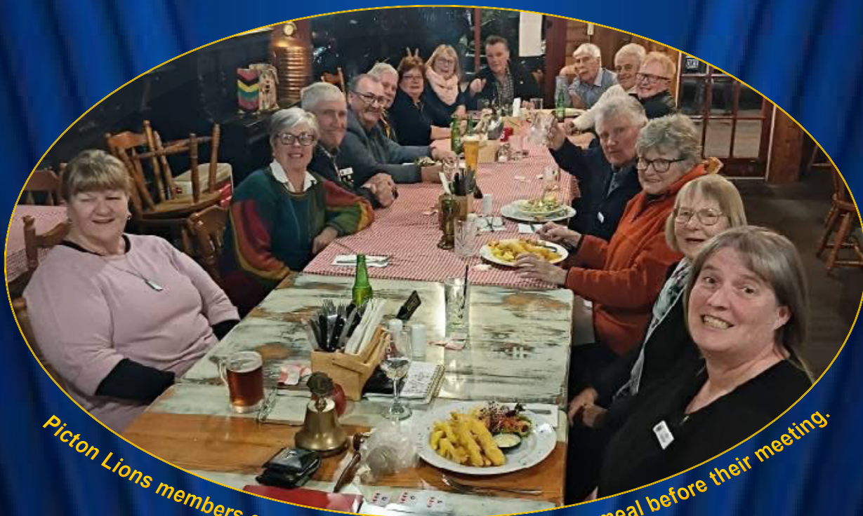
Picton Lions members enjoying Fun and Fellowship over a meal before their meeting.