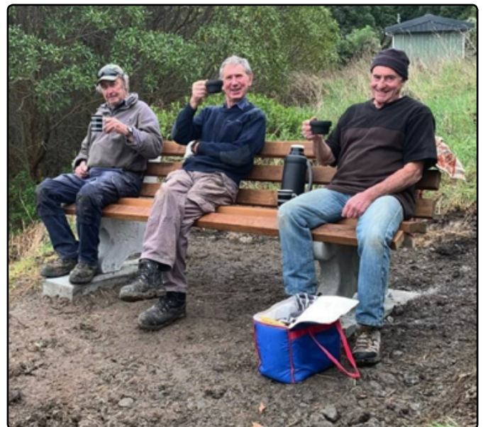
Just some of Kaikoura Lions Club seats.