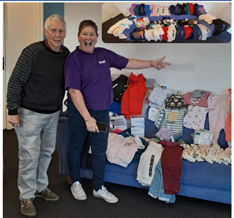
Christchurch South Ferrymead Lions are Proud to support Aranui Plunket with warm winter clothing.