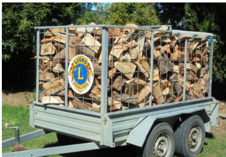
Chilly mornings - Golden Bay Lions have the answer, get a ticket in our FIREWOOD raffle - Proceeds going to help flood victims over the hill around Motueka. Be in TO WIN!

✅ It is a symbol to be worn with pride - not displayed digitally.