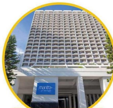
Mantra on View

We are getting ready to welcome Lions, Leos and partners to the ANZI Pacific Forum 5th-7th September 2025