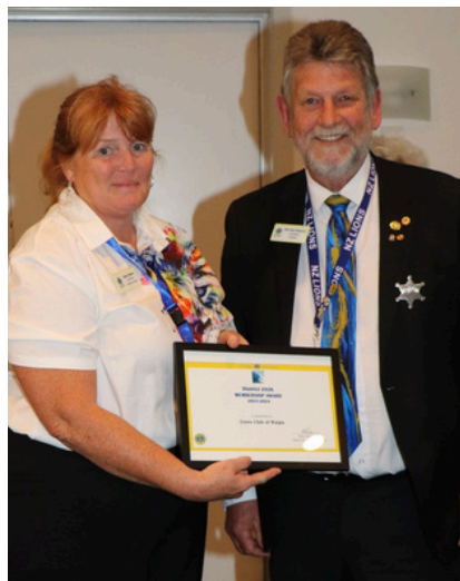
Membership Award Waipu Lions