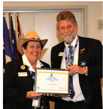
Outstanding Club Orewa Lions