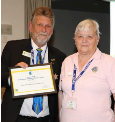
Outstanding Community Project Warkworth Kowhai Coast Lions