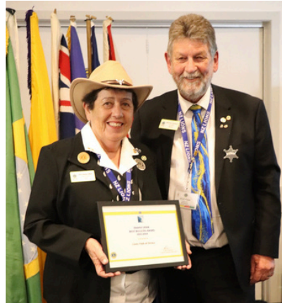
Best Bulletin Orewa Lions