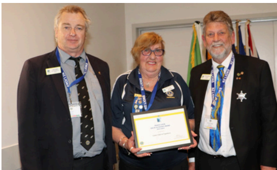
Youth Award Papakura Lions