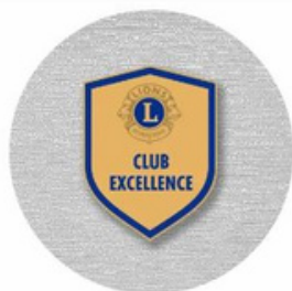
Club Excellence Award

Your District and Club Administration Support Team