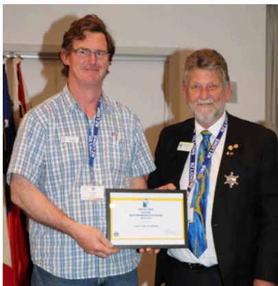
Most Improved Club Kaikohe Lions