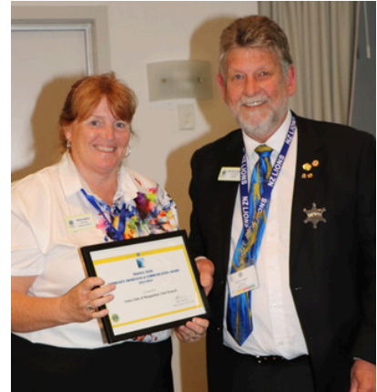
Community Awareness & Communication Mangawhai Club Branch