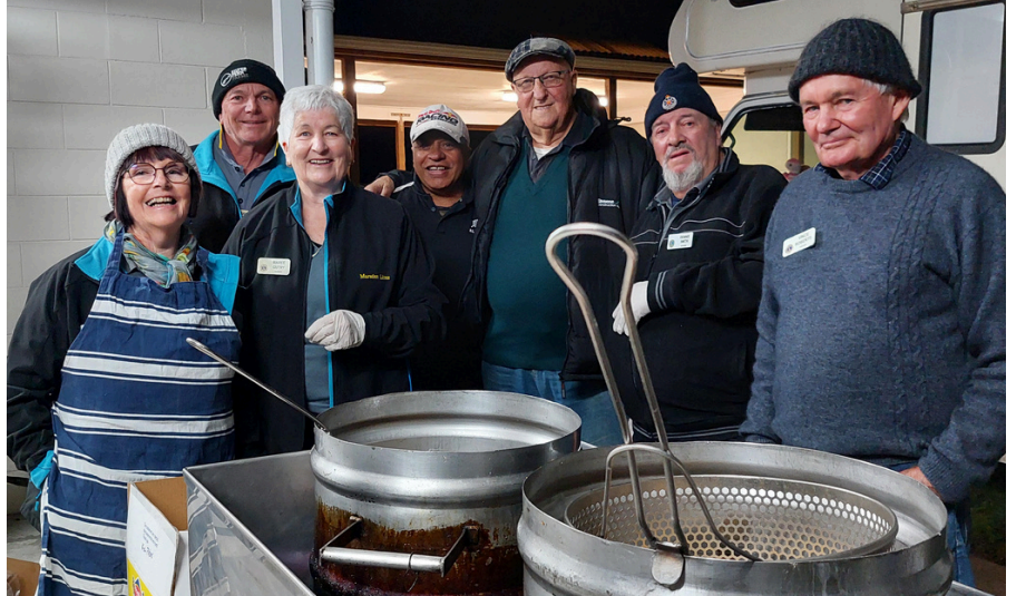
Marsden Lions waiting for everyone to arrive to start cooking on Thursday night