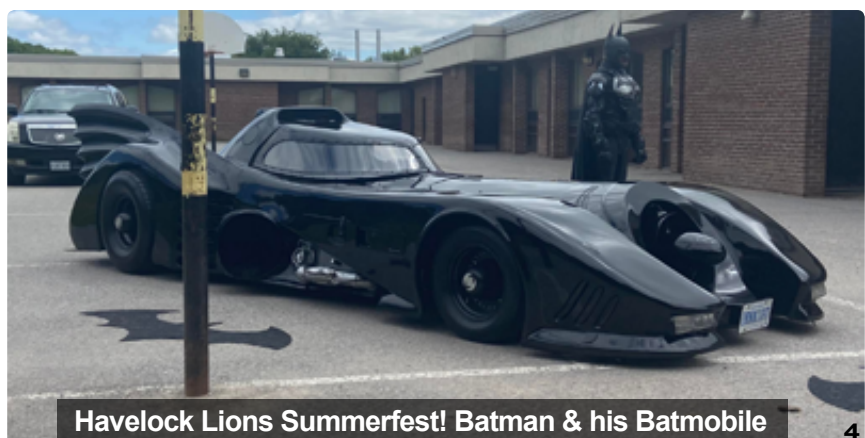
Havelock Lions Summerfest! Batman & his Batmobile