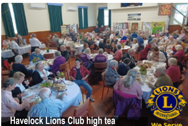
Havelock Lions Club high tea