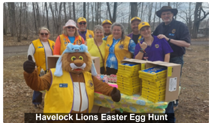
Havelock Lions Easter Egg Hunt