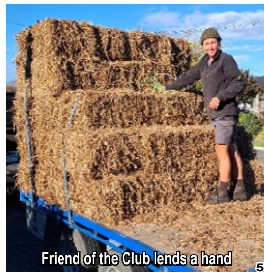
Friend of the Club lends a hand