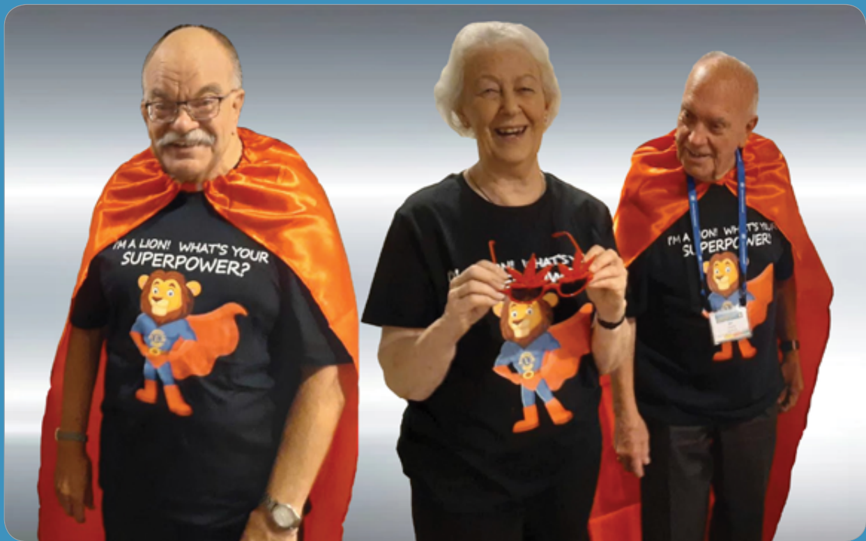
"Getting ready for our fun 'S' evening. Our D.G. (and C.C.E) with her left and right hand men." MD Convention.

E. 202e.dg@lionsclubs.org.nz T. 0211487476 Club: Amberley District