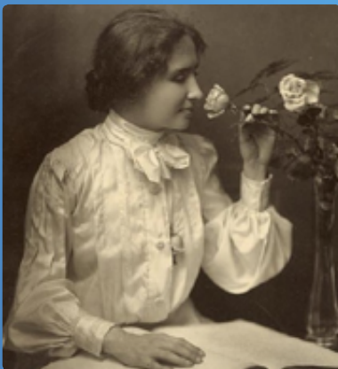
Helen Keller 1880 - 1968

Cut off as I am, it is inevitable that I should sometimes feel like a shadow walking in a shadowy world. When this happens I ask to be taken to New York City. Always I return home weary but I have the comforting certainty that mankind is real flesh and I myself am not a dream.