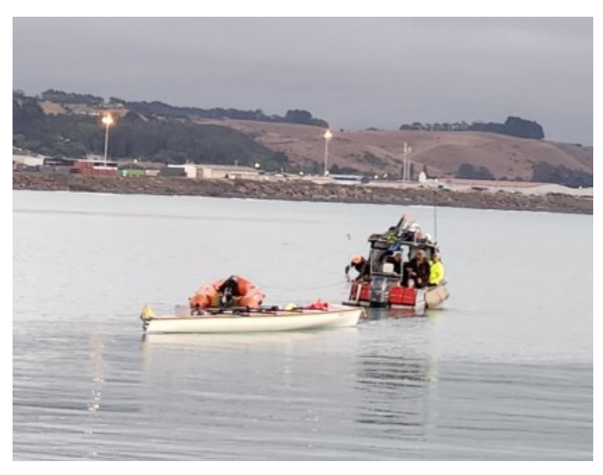
Friday 23 February

Departing Oamaru harbour - coastal boat & IRB being towed back to Hilderthorpe where they finished rowing the day before.