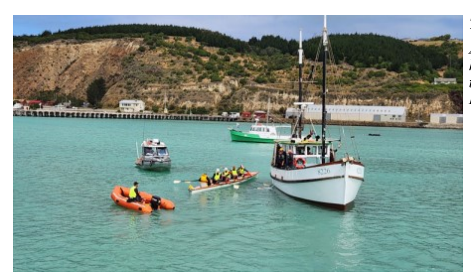
Thursday 22nd February Arrival in the Oamaru harbour after being towed back from Hilderthorpe.

Friday the 23rd was a very early start to arrive at the harbour by 6am with the departure around 7am. The coastal boat & accompanying IRB were towed back to Hilderthorpe for an 11½ hour day rowing to get to Timaru as there was no landing access between Oamaru & Timaru, & previous supporting fishing boats with berths were unavailable. The Rowing for Life Facebook page has photos of their departure from Oamaru & arrival at Timaru, plus a video of Hector's dolphins cavorting near the boat. Plus many posts from previous locations. The two boat trailers were driven to Timaru by Waiareka Valley Lions.