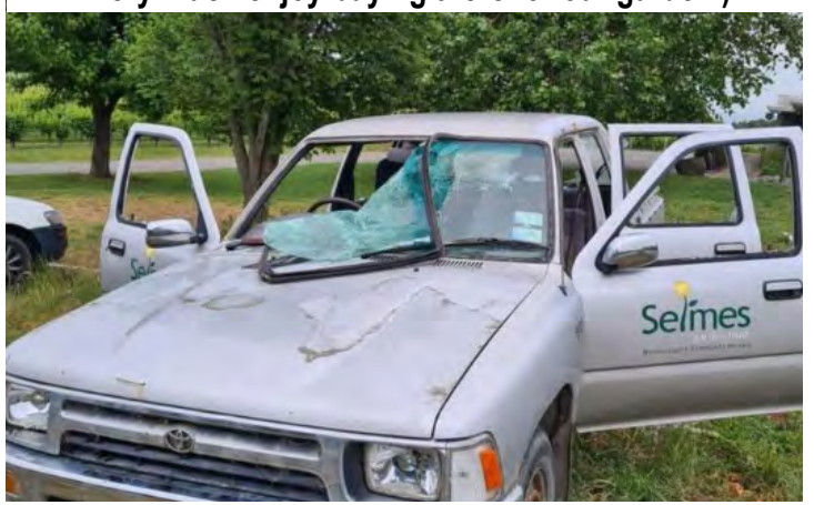
We are a Garden Centre and Nursery that provides inclusive employment and training opportunities to people with disabilities in Marlborough.

(Well done Beavertown Blenheim Lions for supporting this great initiative with your generous donation. I very much enjoy buying there for our garden.)