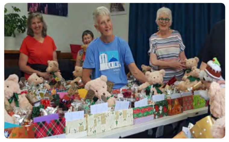
Motueka Lions Club donated $400 to the community Christmas event. The organisers gave out 120 pantry boxes presented in collected shoe boxes, covered in Christmas wrap with a handwritten card. Frozen veges, butter, cheese and cold ham etc were added on the day.