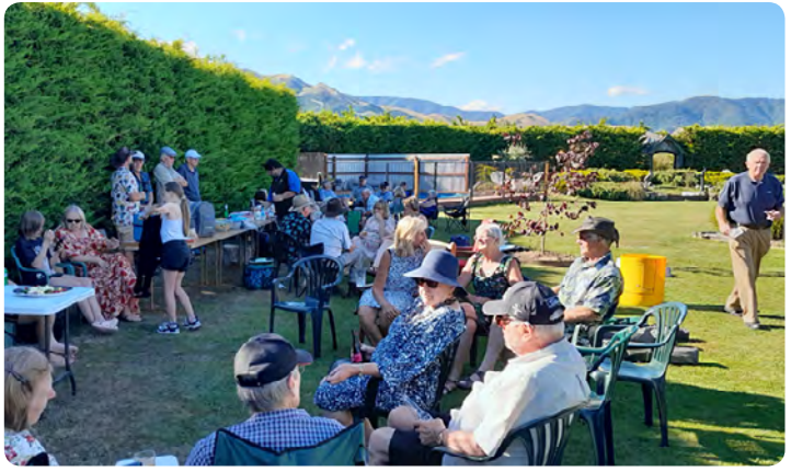
Oxford & District Lions and Partners enjoyed a Progressive Dinner to celebrate January.