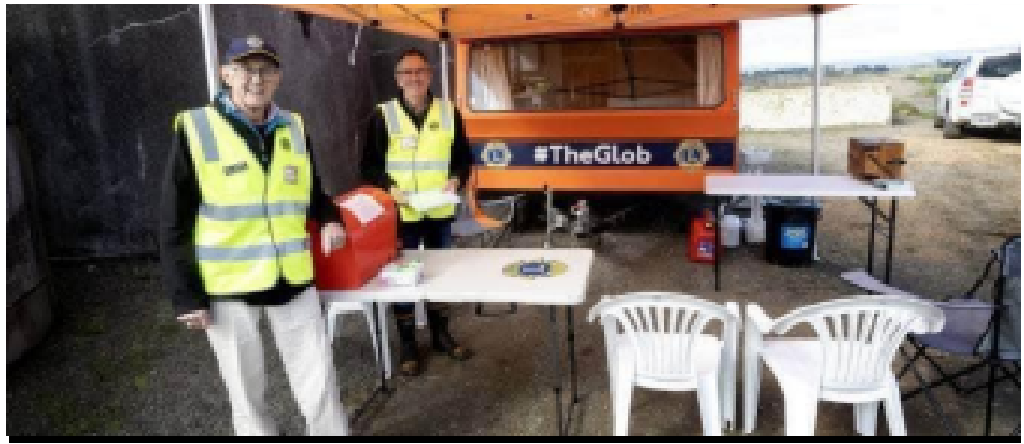
The GLOB - My Health Check

Is receiving great success at the various Events that it has been to. It is booked to attend the Lamb & Beef Expo being held at Orlando Country Club, Waituna West Cross Country Run, Hunterville Shermozzle, Hawkes Bay and Martinborough events. This local project is gaining national attention with other Districts wanting to set up their own GLOB Health Check Centres