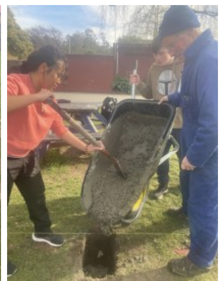
12th of August working bee. The start of a great project to install seats in front of the courts for parents to watch sport. A huge thanks to Waiareka Valley Lions for helping us do this.