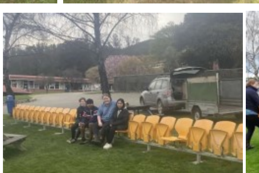
On 16th September, SKC Leos completed part 2 of our seats project, bolting in seats in front of our school netball courts for parents and spectators to sit on during winter sports or whatever the use may be.