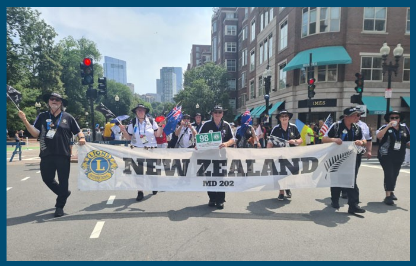
Parade of Nations, Boston 2023