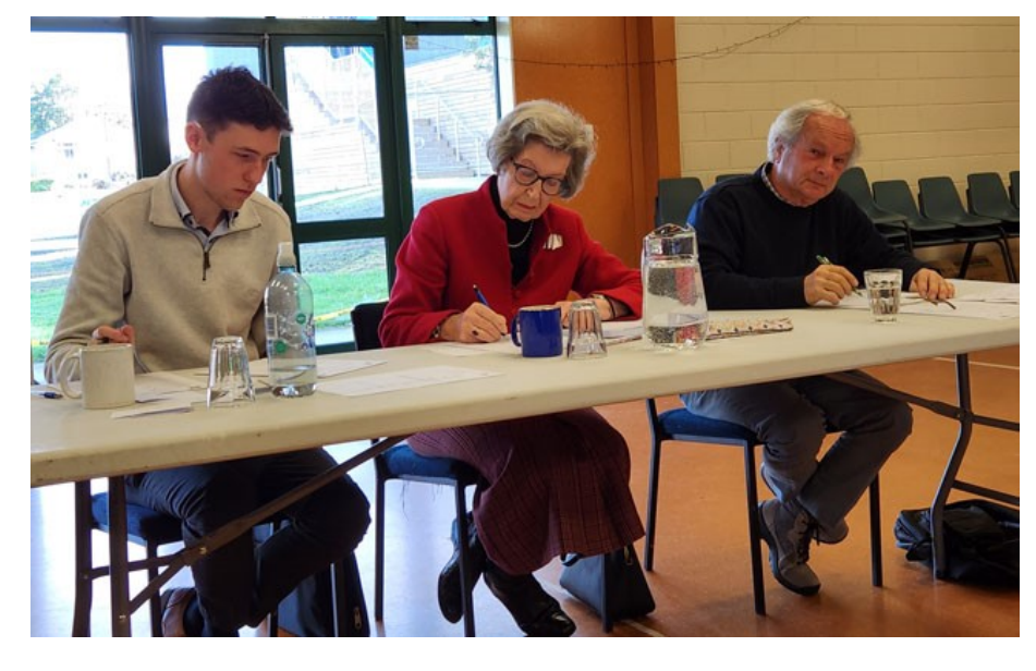
The judges hard at work deliberating