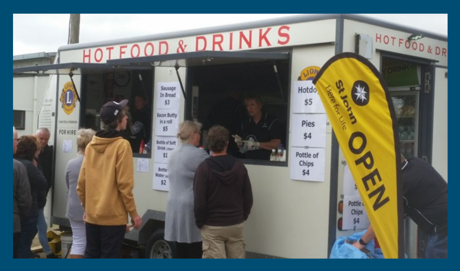
Ashburton Lions Food Trailer being operated at the South Island Motorhome Show by St John Cadet Unit.