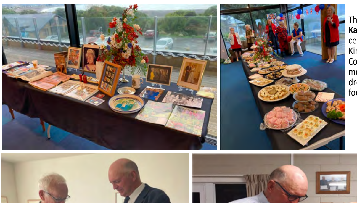
This is how Kaikōura Seaward Lions celebrated King Charles 111's Coronation - with Royal memorabilia, members dressed to impress and food fit for a King.