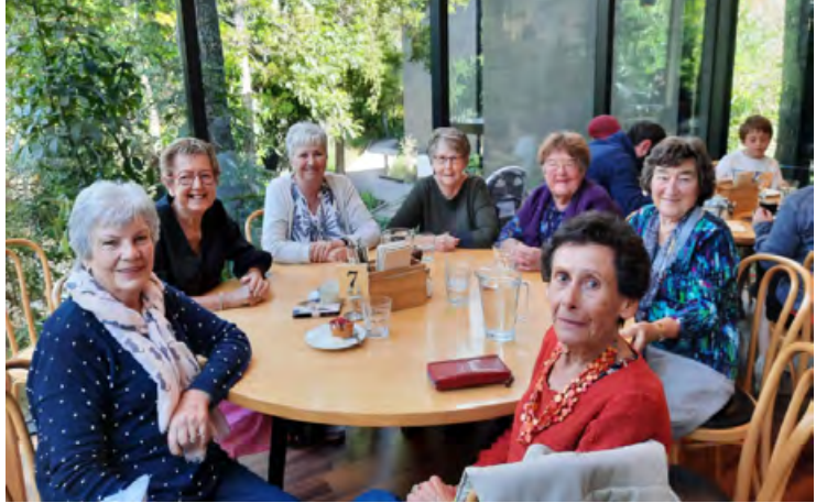
Nelson Lioness Lions know the value of meetings over a coffee, chat and organising their next project.