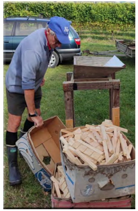
Motueka Lions Kindling project