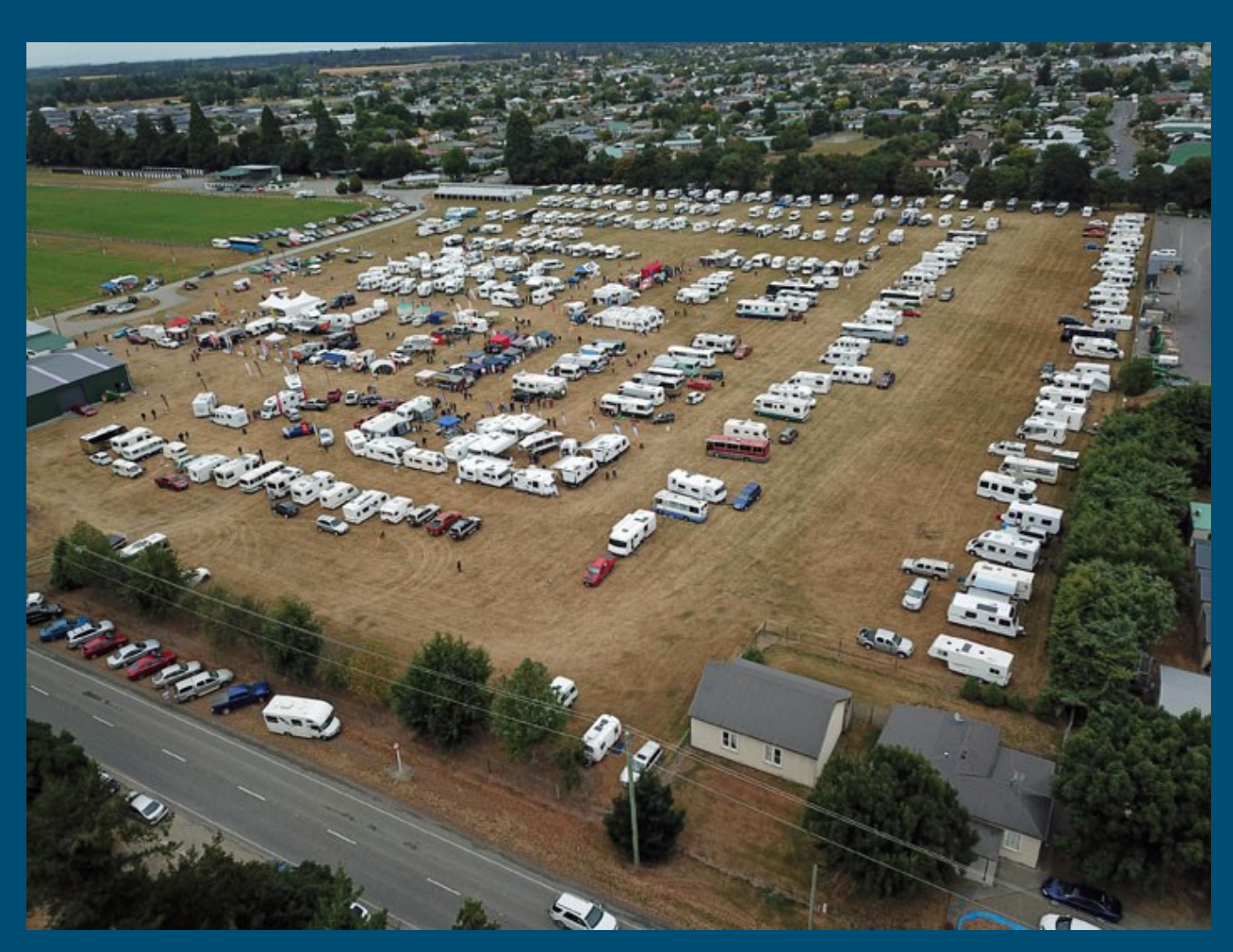
The South Island Motorhome Show, Ashburton during a previous year