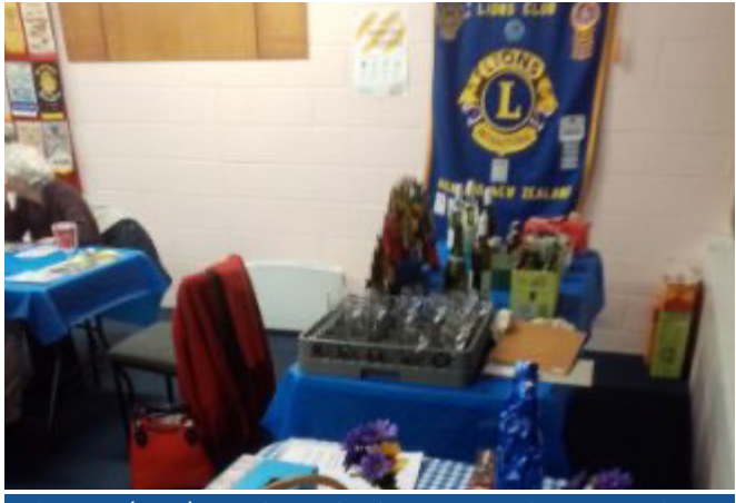
Lion Ton (rear) led with Invitation to all to sing the National Anthem and then proposed the Loyal Toast.