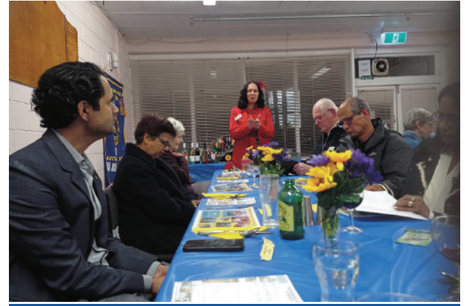
After the dinner and dessert was enjoyed, everyone was in fine fettle with conversation humming along, members and guests strategically seated to mix and mingle in the fellowship Lions are The 45th Anniversary cake was brought out and "tabled".