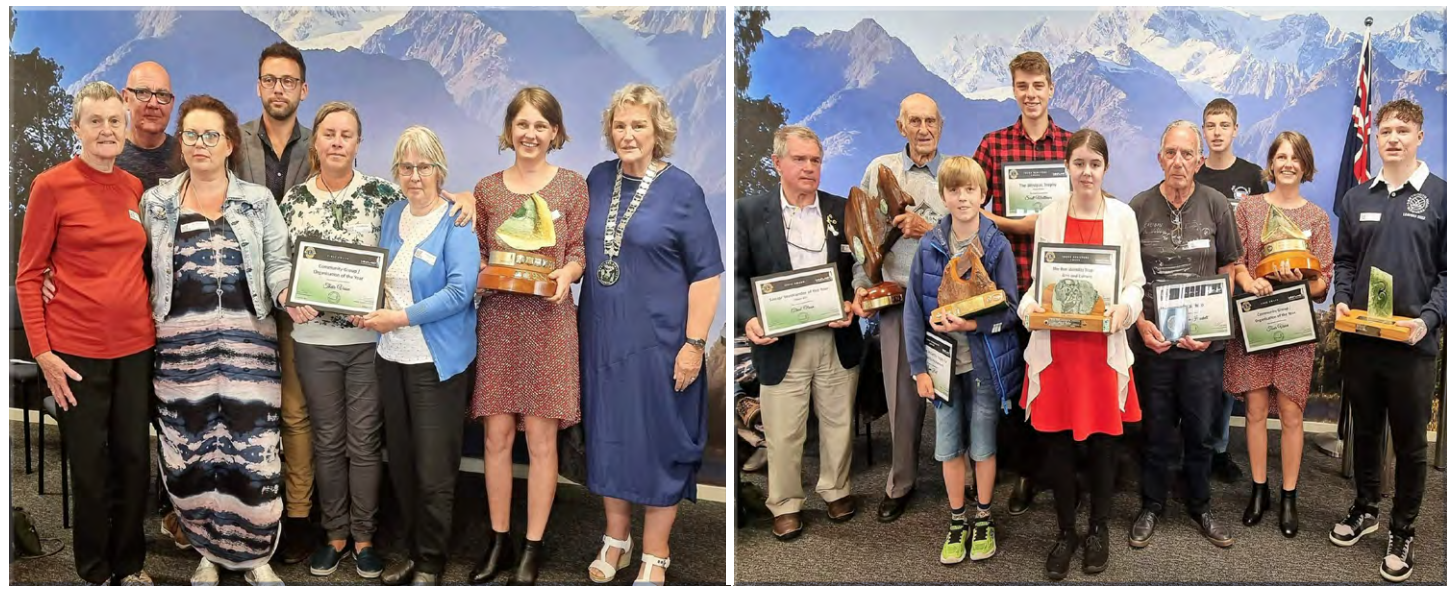
Hokitika Lions - Congratulations to the recipients of the Hokitika Lions Club Community Awards. (Hokitika Lions posts certainly put their name out on the w.w.web - take a look at their Facebook posts.