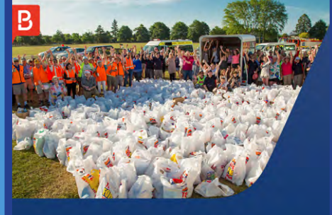
Toot For Tucker Tuesday 6th December 2022 We are Tooting Tonight Oxford Lions