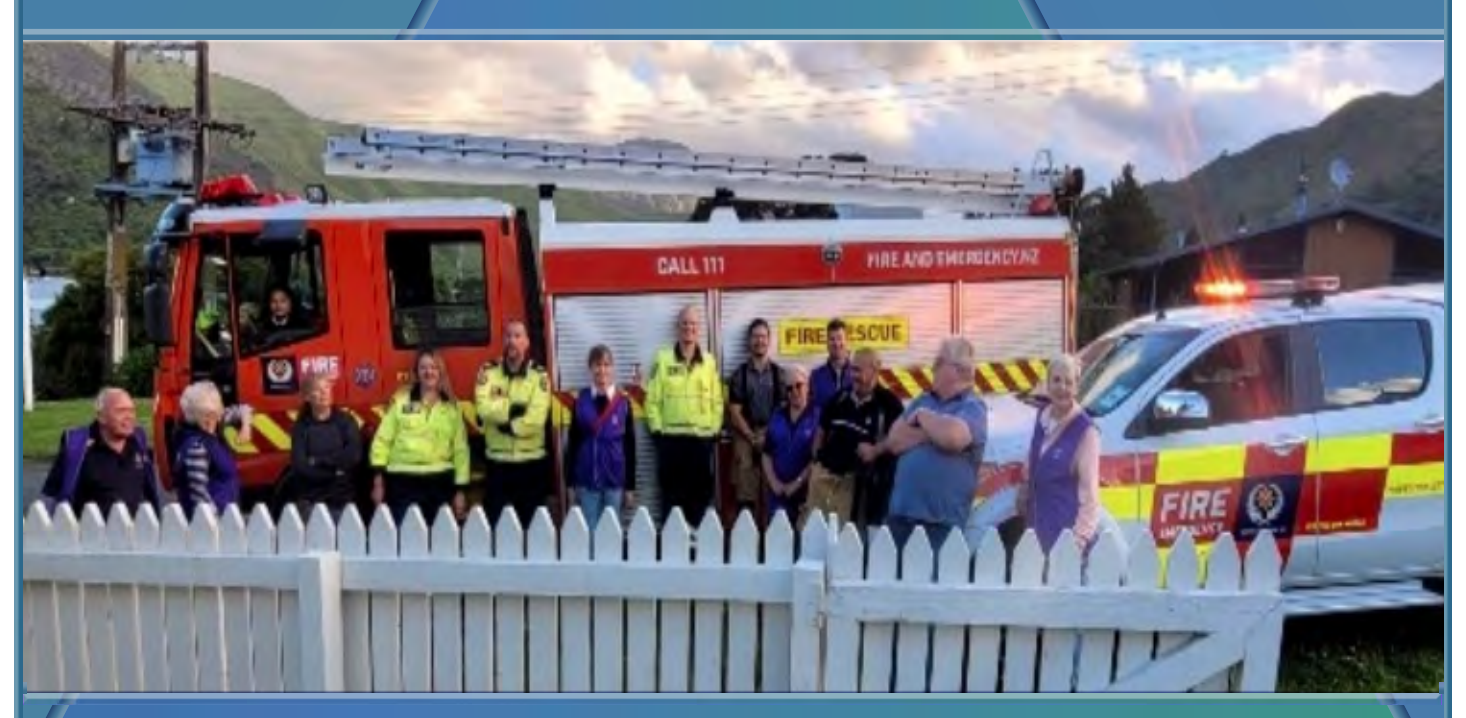
Havelock Lions - Toot for Tucker Havelock style - sirens and horns blaring brought a huge response.