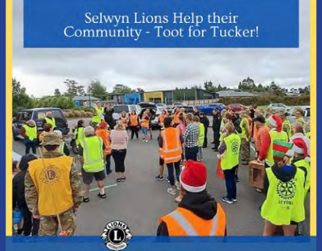
Selwyn Lions / Rolleston Rotary and many other organisations bonding together donating time and love!

Snail Cafe run by our local Lions Club of Hokitika. On offer will be Lion Burgers and of course, skewered snails.