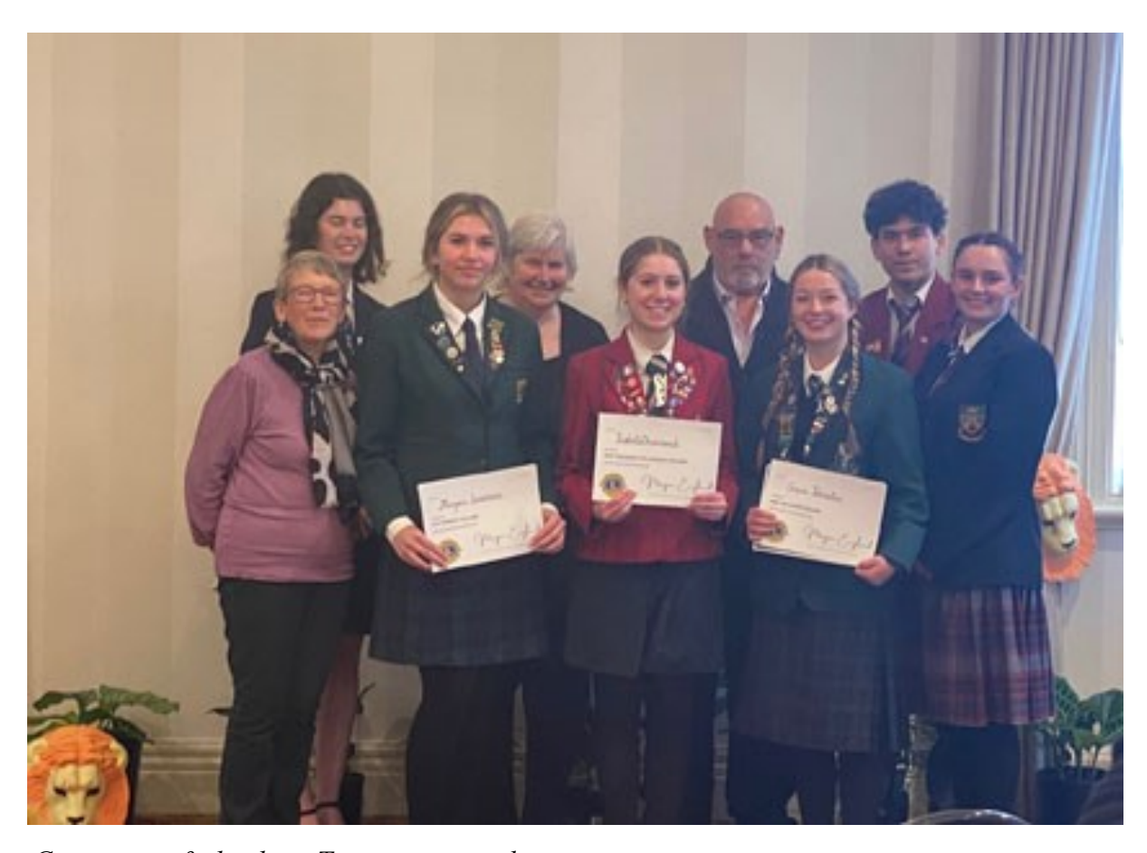
Contestants & the three Toastmasters judges

"My thanks to your clubs in supporting this important national Lions event."