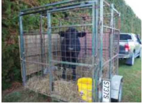
A calf was offered for the auction.

280+ donated baleage, 20 hay bales, I Spring calf, 4 bales pea vine,22 registered bidders, 7 local schools and the PNth Rescuehelicopter to receive funds, 15 cartage contractors, 12 healthcheck-ups in the Glob.