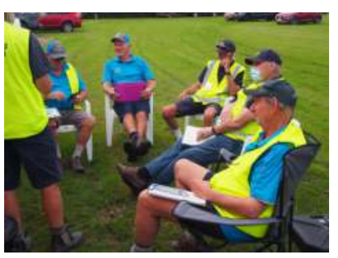
Lions waiting for their health check up.