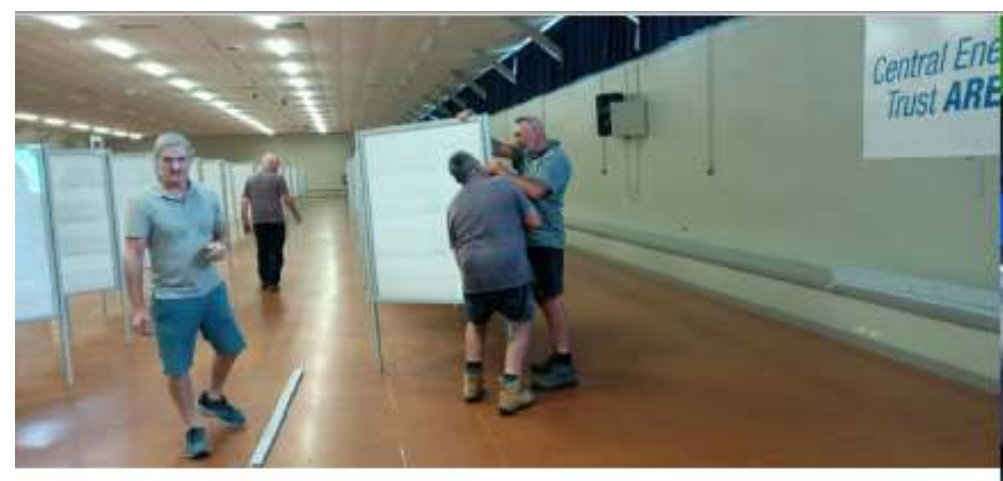
A RECENT WORKING BEE TO SET UP STAMP EXPO