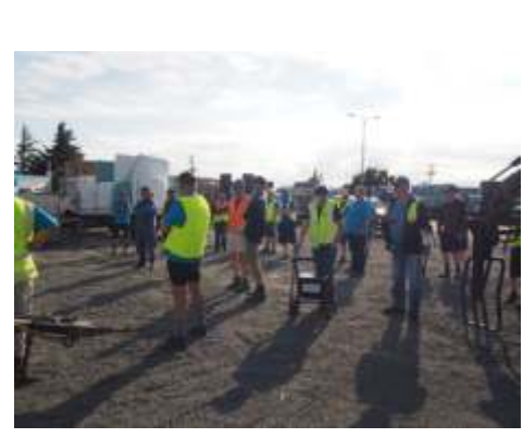
Bidders taking part in the auction.