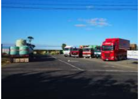
Trucks loaded with baleage ready for the auction.