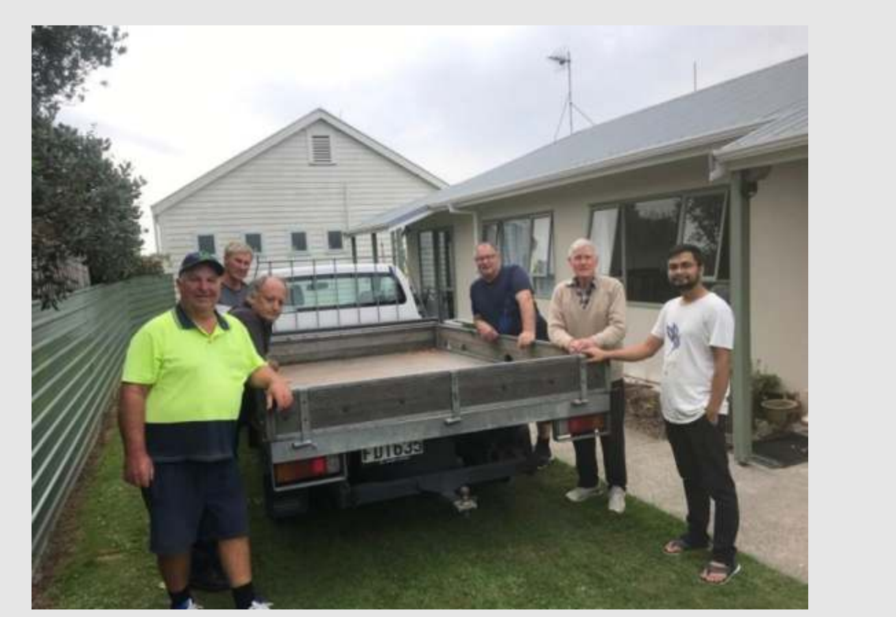
Normanby & Districts - House Movers