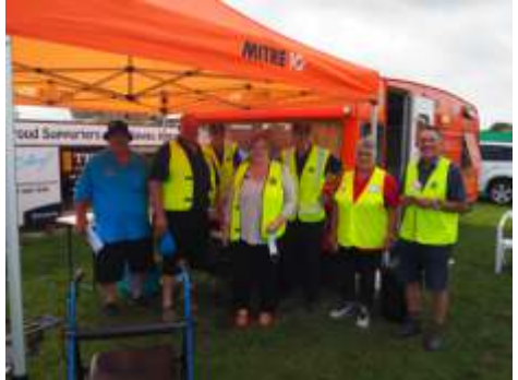
The Glob Health caravan was in attendance- here's the health team and committee members.