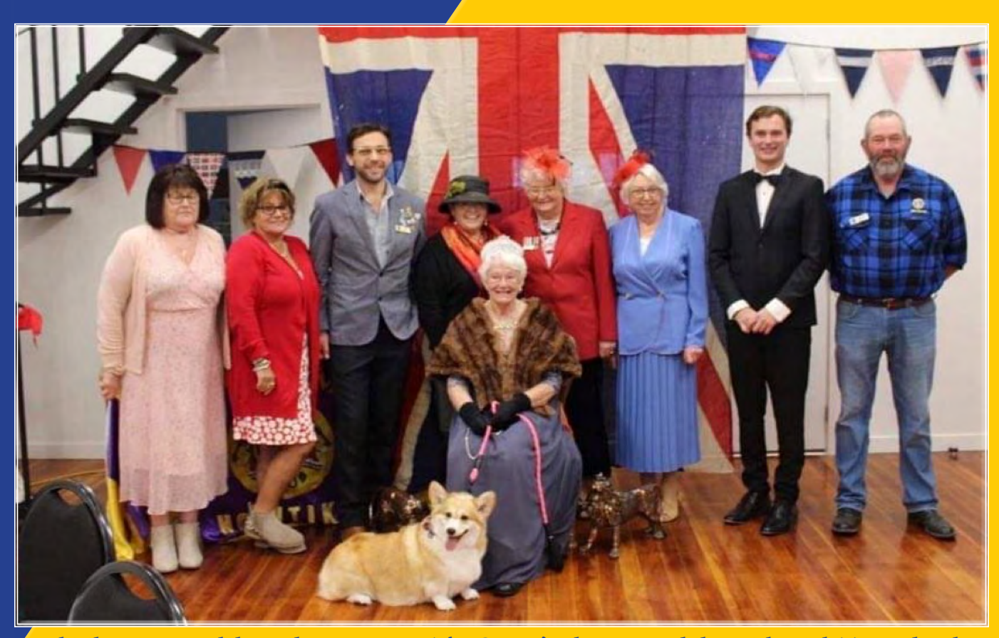
Hokitika Lions - celebrated Her Majesty The Queen's Platinum Jubilee with High Tea and style.