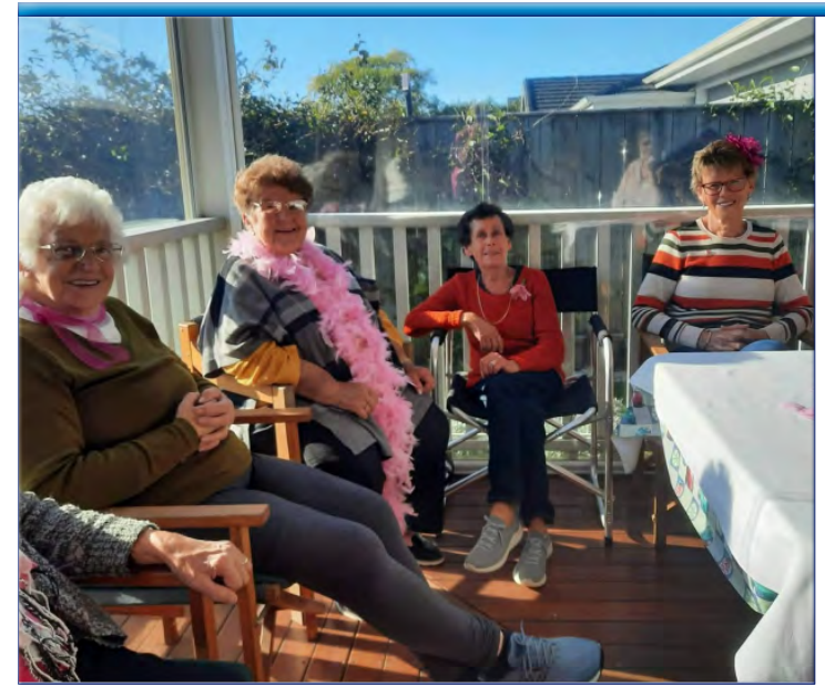
Nelson Lioness Lions - celebrated a Pink Ribbon afternoon enjoying the Nelson sunshine.