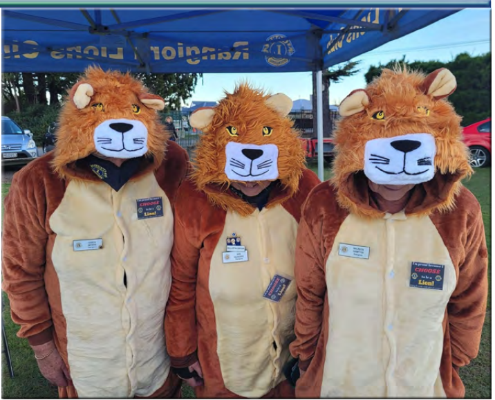
Rangiora Lions - what great publicity - for these well dressed Lions working at BBQ's.