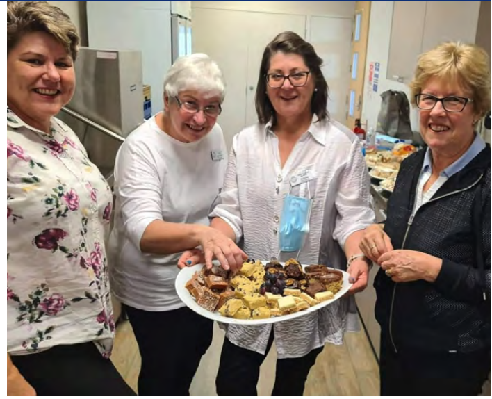
Selwyn Lions - catering afternoon tea for a memorial service. Sandwiches, savouries, gluten free platter and homemade slices which our president could NOT keep her hands off!! 17