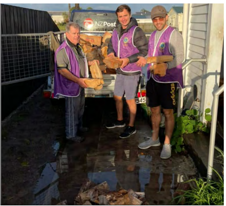
Where there is a need, there is Lions. Delivering wood donated by a Hokitika family to a deserving pensioner.