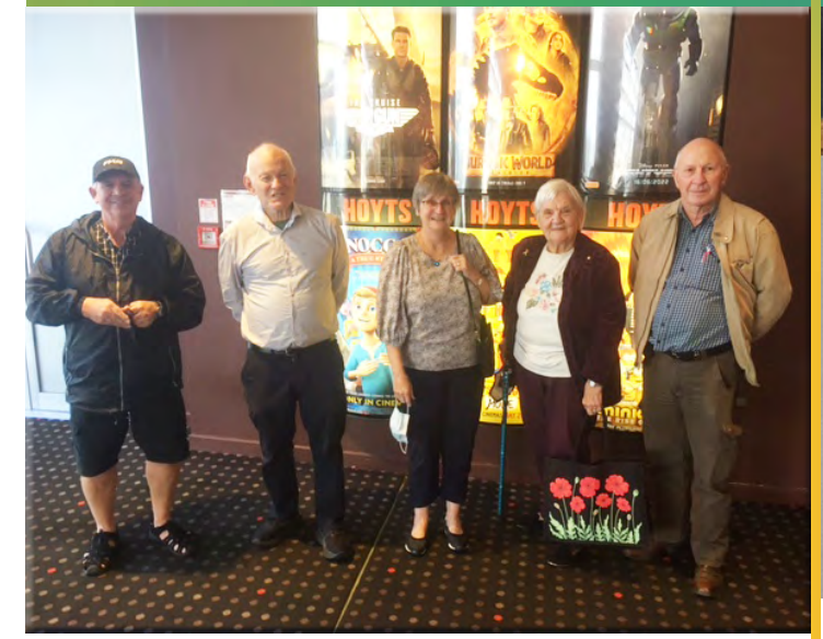
Christchurch Host Lions have taken another step in the social scene movie theme Downton Abbey - great rates for over 65s.