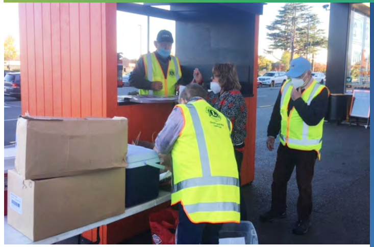
Christchurch Host team members setting up. This is our first bbq for 18 months, due to COVID 19 and enforced cancellations... Great to be back.