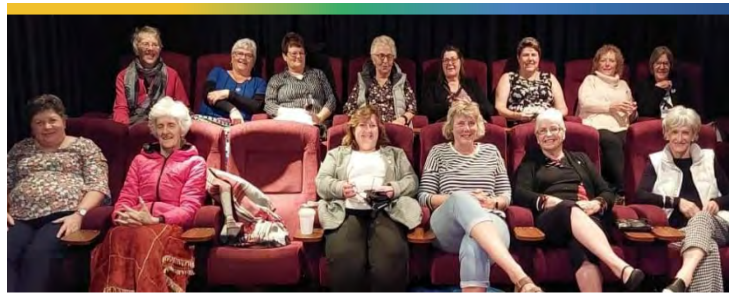
Selwyn Lions - a well behaved group after dinner and a private screening of Downtown Abbey.

Club Presidents - a good Supper Meeting Quiz - hopefully you may need heaps of chocolate fish prizes!