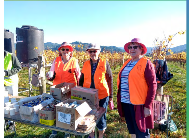
Beavertown Blenheim Lions - raising funds to give back to our community. Water Marshalls at the wonderful Saint Clair Vineyard Half Marathon. Fantastic weather and all competitors were very appreciative. See you next year.