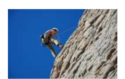
This Photo by Unknown Author is