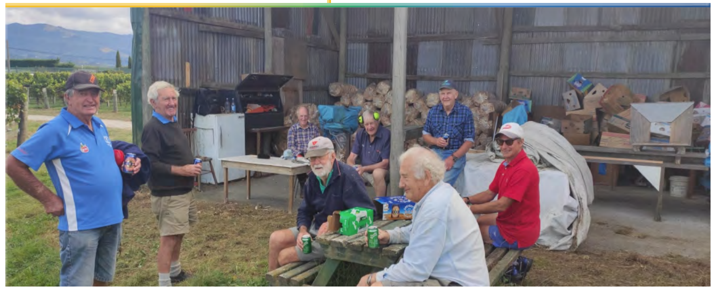
Motueka Lions have a well earnned rest and social time, after filling 100 bags of Kindling.