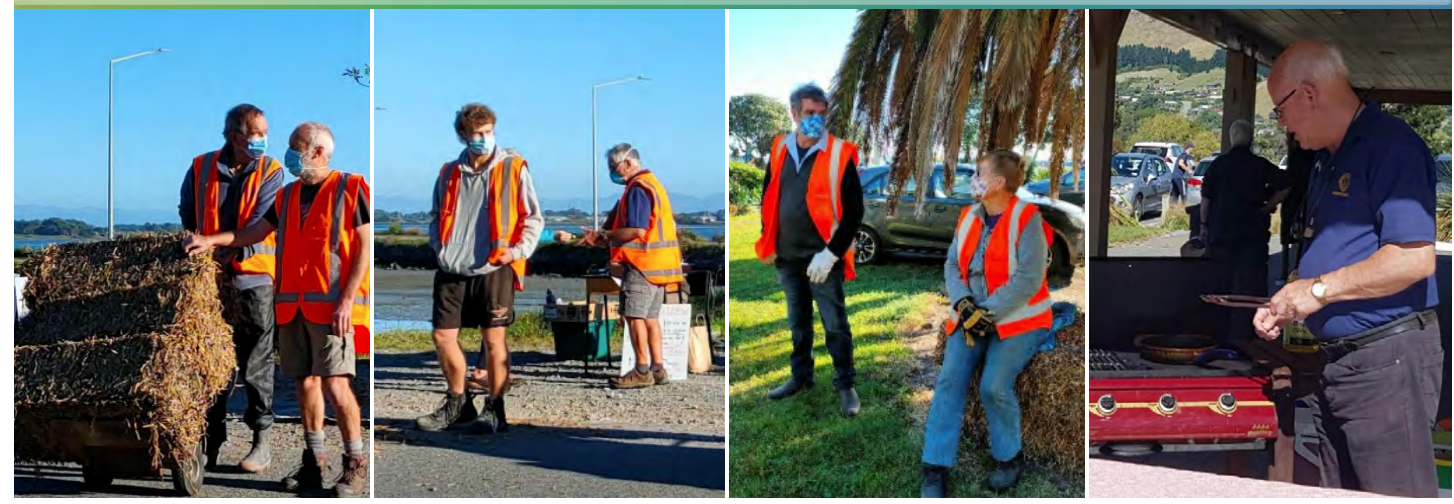
Ferrymead Lions - had an excellent Pea Straw sale at Sumner & Redcliffs when we did not put out any pamphlets. We sold all 650 bales but only 2 trailer loads of compost. Many thanks for all the helpers. And BBQ fundraising.