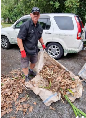
Wigram Lions - clean up working Bee at the Lions Den.