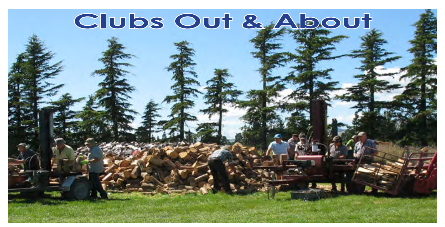
Glenmark Lions - 14 members had a busy but enjoyable afternoon, splitting 25 tonne of pine firewood to be sold throughout Amberley.