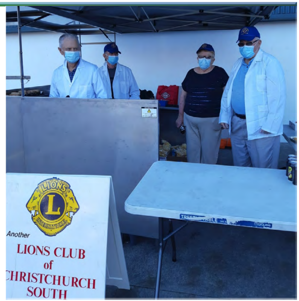
Christchurch South Lions - sign of the times BBQ

at TOPEC in Taranaki. The camp is for youth 12 to 16 years of Age. Applications close 7 May. Poster, Application and Health Declaration are available in the website.