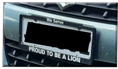
GREAT Lions advertising!