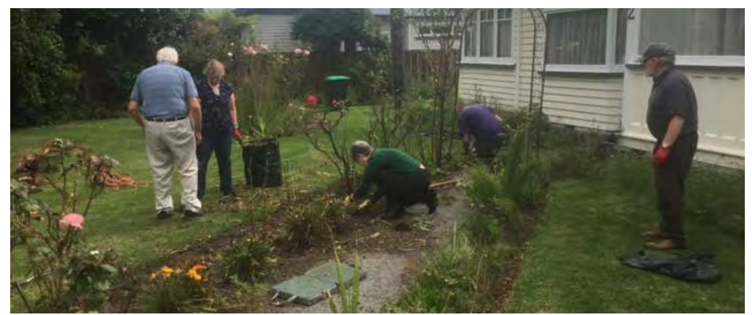
Christchurch Host Lions - did two working bees to tidy up the boundary shrubs, flower beds and a lawn mow for a very appreciative gentleman. (Service can still be done during these tough times.)