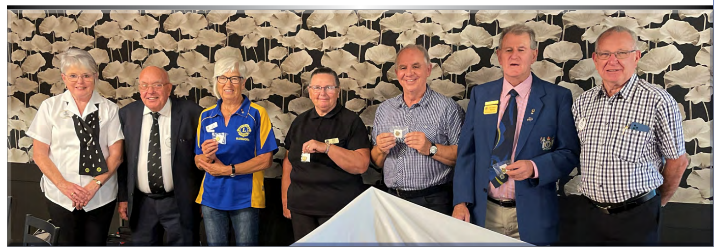
100% Club Excellence Award - some clubs did not have representatives at Convention, so Zone Chairs will be delivering them.