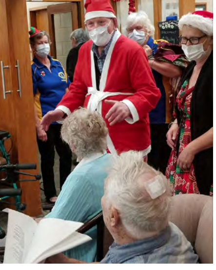
Father & Mother Christmas took time out from their very busy world visiting to drop into a Retirement village, joined by other Lions members.