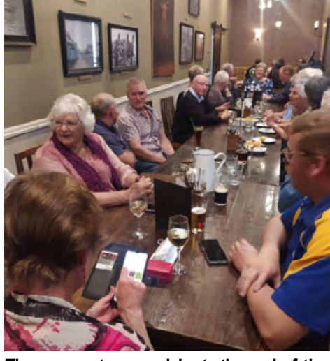
The manure teams celebrate the end of the Well done Lions!