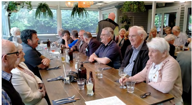
Wigram Lions - Christmas social dinner for our club members and partners. It was a lovely night of laughter and dinner for our last catch up before Christmas. Stay safe everyone, and have a lovely Christmas.