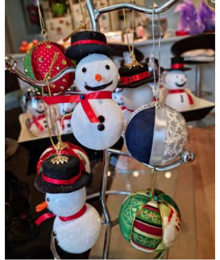
Rangiora Lioness Lions - just some of the Christmas decorations they made for sale.