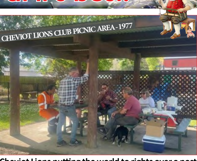
Cheviot Lions putting the world to rights over a post working bee snack.

Christchurch Host Lions - being a Lion isn't all pakeke mahi, as these members know. A regular social time is essential in their search for great coffee.