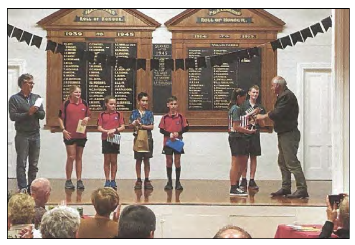
Seddon Lions - Seddon - Ward School Speech Competition.