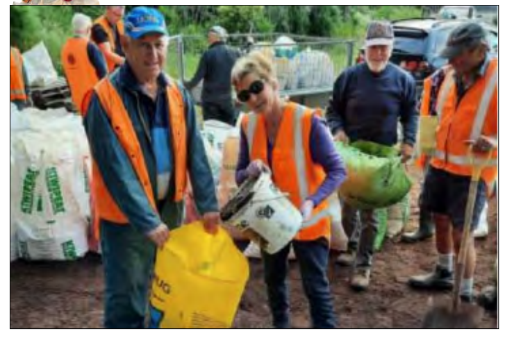
This month was the end of the manure drive and a get together to celebrate. A very popular fundraiser.