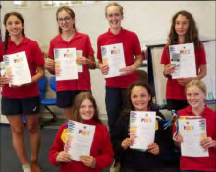
Peace Poster entrants from Cust School.