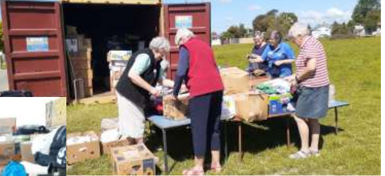
Above - local Lions spent many hours getting the items ready for display and sale.