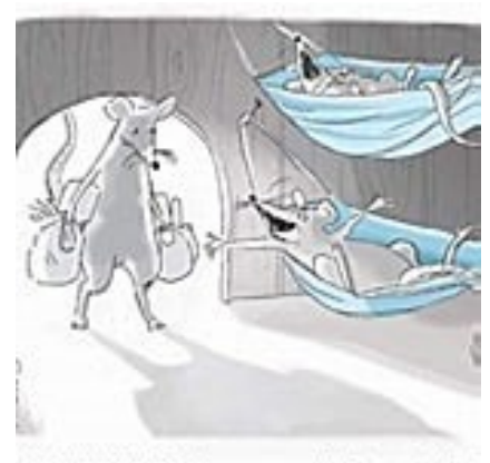
FREE HAMMOCKS, all over town. It's like a miracle!"