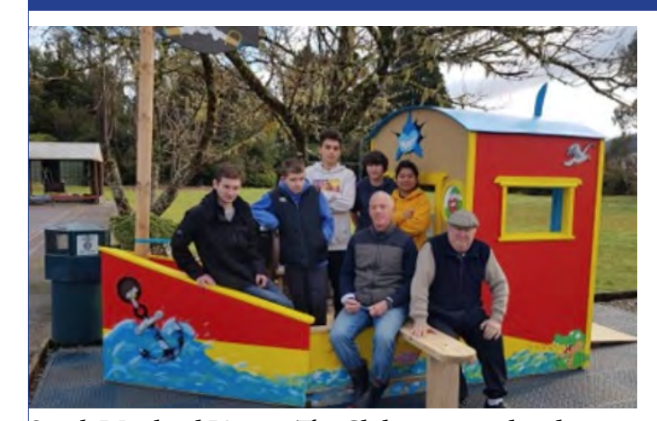
South Westland Lions - The Club sponsored and worked alongside South Westland Area Senior students to build this wheelchair friendly Pirate Ship - shown here with the students and helpers.