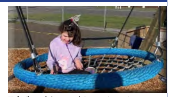
Hokitika and Greymouth Lions joint project - a Playground was developed to cover all ages and chosen to compliment some of the different styles of play - imaginative, active, adventurous, sensory, social and storytelling and wheelchair friendly. This little girl feels safe without her wheelchair.

An aside - Kaikoura Lions recently advertised for members on Facebook - 5 people replied - they wanted to help but not be Lions. They enjoyed comradeship and helping at a Firewood working bee. Imagine the Builders, Engineers and labourers etc ... who would love to be part of a community project building a swing, pirate ship ... - the list endless, the rewards countless.