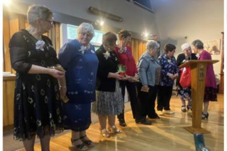
Current Members of the Feilding Kowhai Club