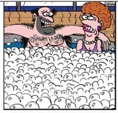
Ya know... I haven't even had to turn the jets on. These bubbles are from that awesome chili you made for dinner.