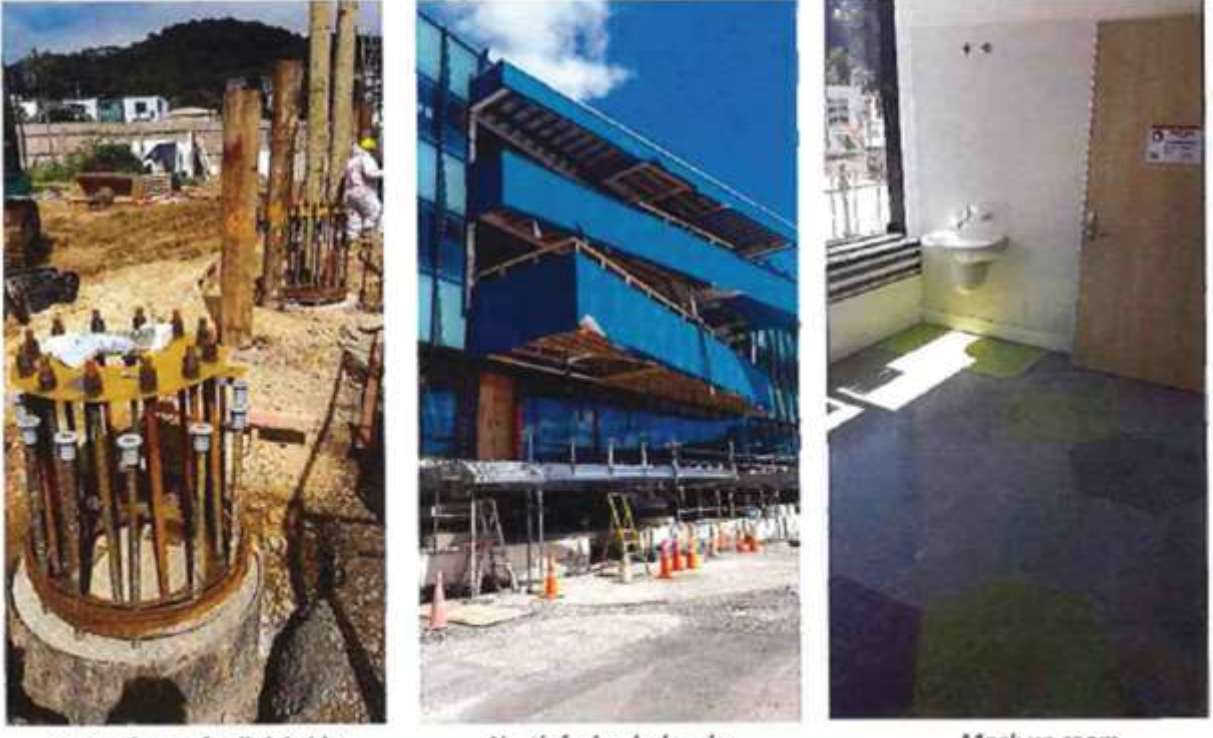
Ground prep for link bridge