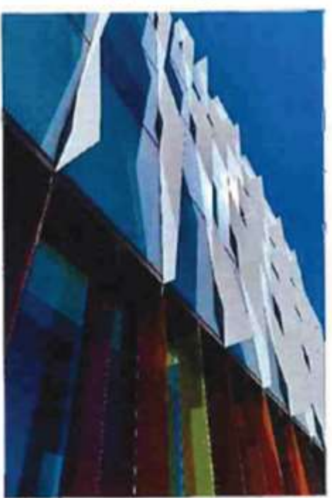
External coloured fins