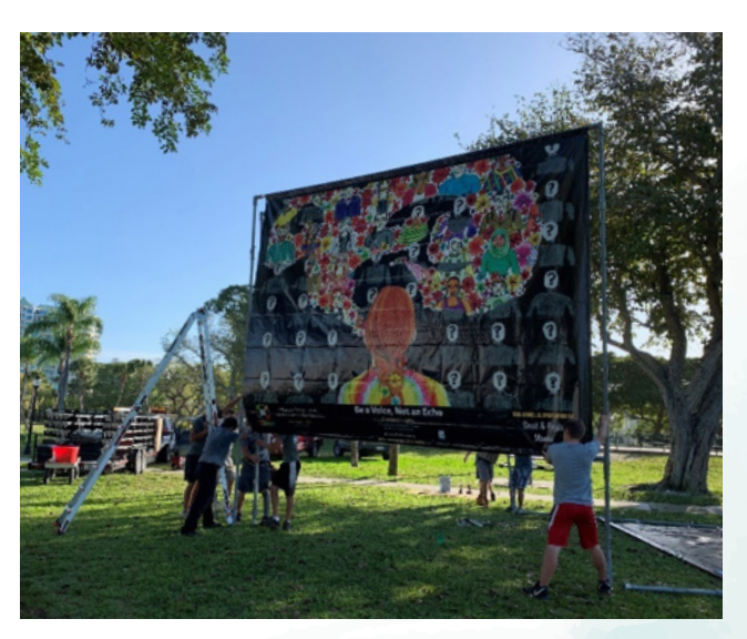
The billboard of Mackenzie's poster being erected at the exhibition in Sarasota Florida, January 2020