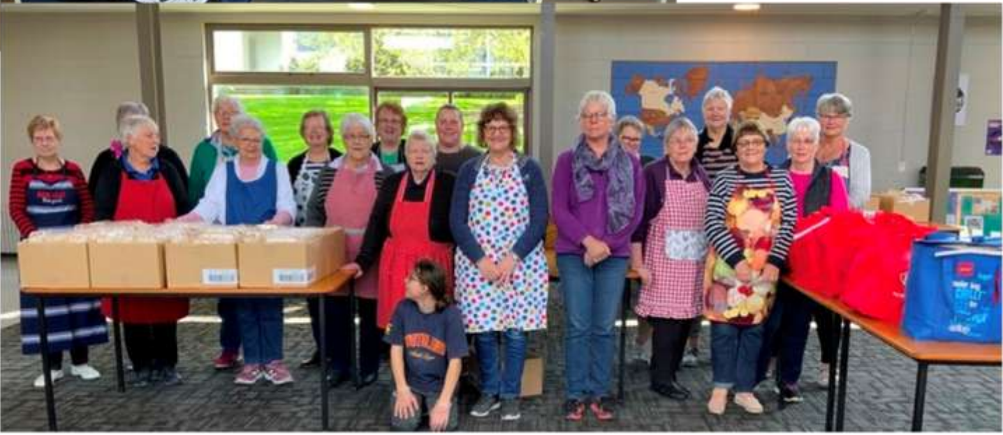
"We Serve Because Kindness Matters"

Table to the left are having a great Laugh. Must have been a great joke.