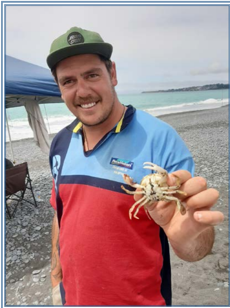
Kaikoura Lions - Fishing contest. Some caught large and some caught small.