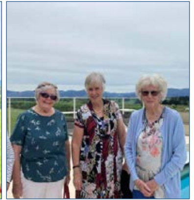
Beavertown Blenheim Lions - a great afternoon celebrating the end of a busy and eventful year.... and a fantastic venue for high tea.