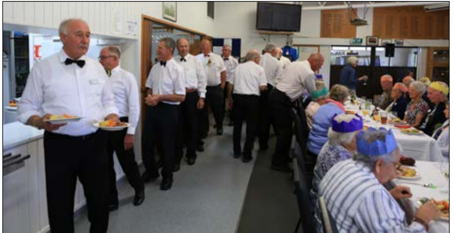
Kaikoura Lions - celebrated our 47th annual Over 70's Living Alone Christmas Dinner for 85 guests, who sat down to a three course meal, Christmas cake, goody bags and an open bar. Every year we have a waiting list. Our Lions dress to impress as waiters and our partners do the food preparation and also act as hostesses. A highlight for both our Lions and our Communities year!