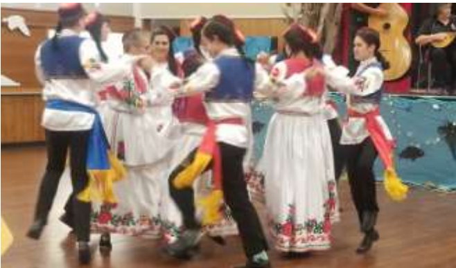
Left: Absolutely Fabulous Entertainment Put on by these Kola Dancers