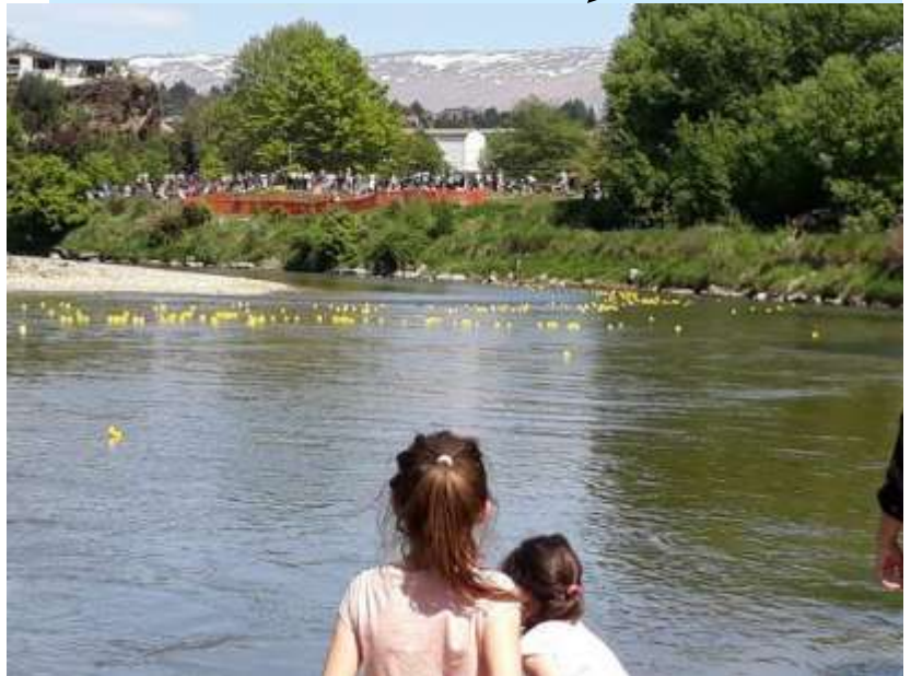
Ducks getting close to the finish line

The annual Duck Race took place on the Manuherikia River on Sat 2nd November, run by the Alexandra Parents Centre. As they did last year, the Parents Centre asked the Lions Club to help out as safety marshals along the river bank track and have our food caravan there with hot dogs and chips.