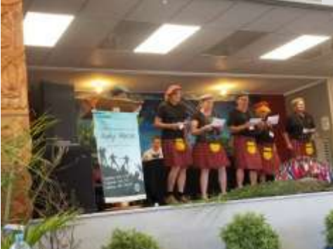
Left: Table setting for the evening meal Bottom Left: Some of the entertainment At the 202K convention.