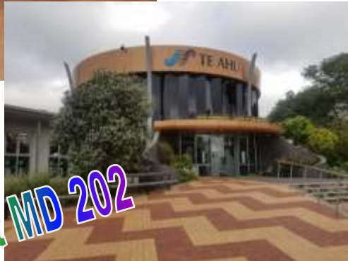
Above : the community centre where the 202K district Held the evening dinner.