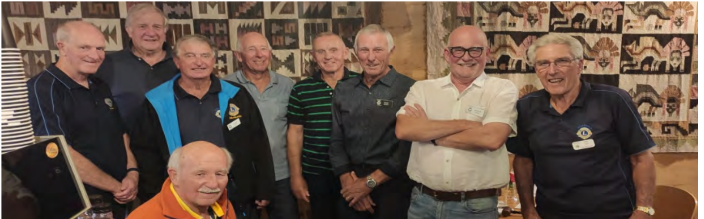
Motueka Lions officers for our 2022 - 2023 year.