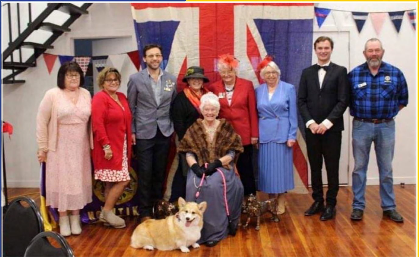
Hokitika Lions - celebrated Her Majesty The Queen's Platinum Jubilee with High Tea and style.