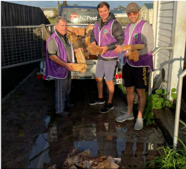
Where there is a need, there is Lions. Delivering wood donated by a Hokitika family to a deserving pensioner.