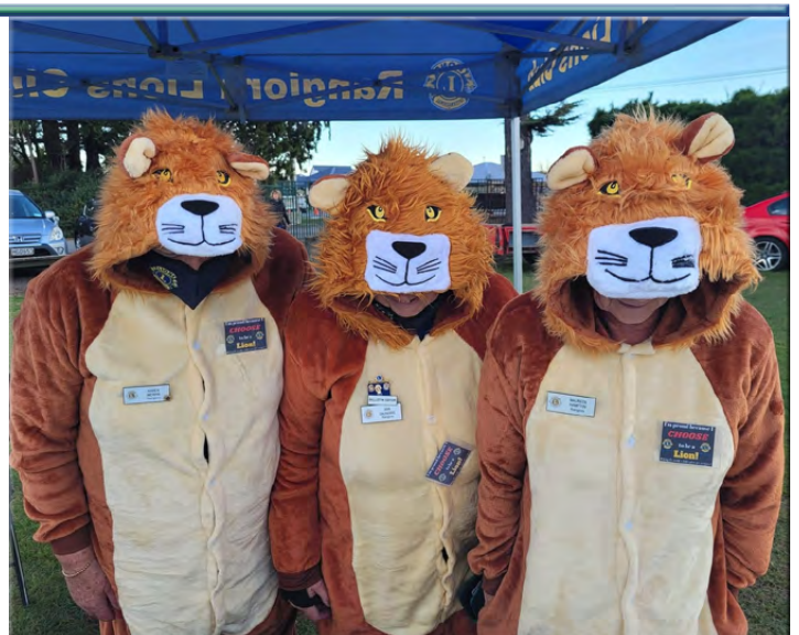
Rangiora Lions - what great publicity - for these well dressed Lions working at BBQ's.