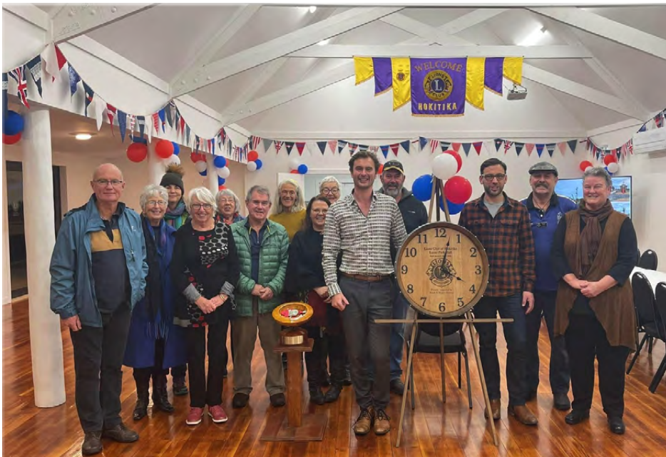
... and the count down to the opening of Lazar Park Hall - yet another Hokitika Lions project!

These photos are just a few of those posted on Facebook. All the world can see what a "Busy" Lions Club, Hokitika is!