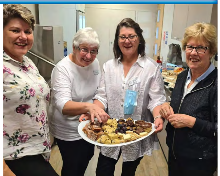
Nelson Lioness Lions - celebrated a Pink Ribbon afternoon enjoying the Nelson sunshine.