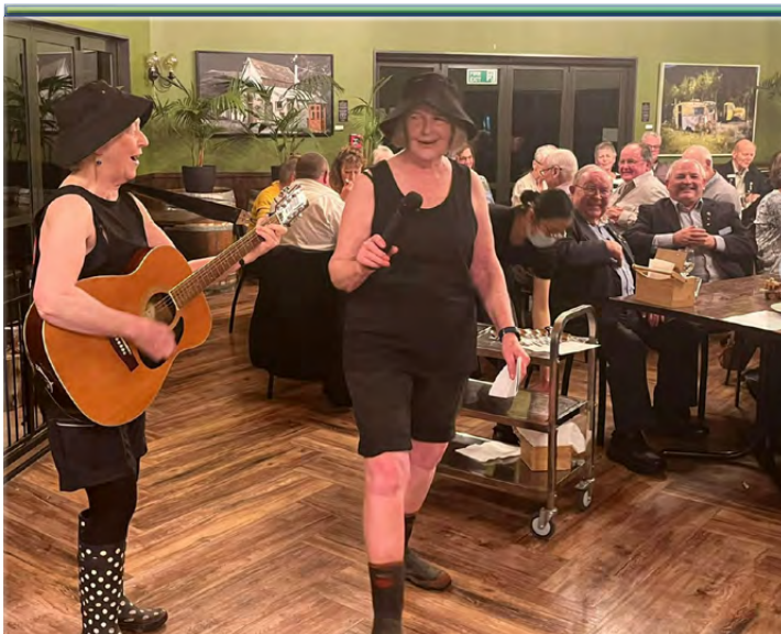
Amberley Lions - Fun time Karaoke at ChangeOver. (No names given.)