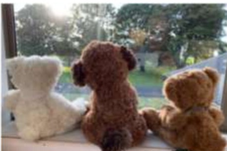
Committee Convenors in session!!!!