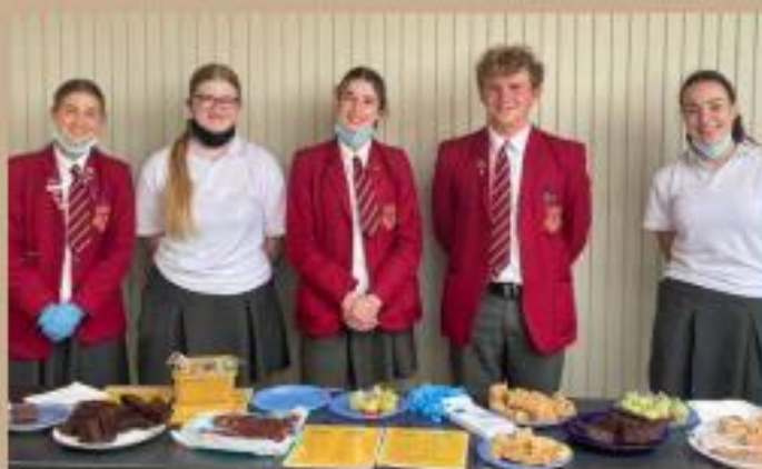
Pictured left: World Vision Bake Sale

thirty students selected from around New Zealand to do so. Hargest has a proud tradition of making a difference in the world via the famine and the offer of a place on this Summit was a recognition of our efforts over the years which total more than $150,000.00.