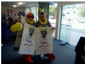
Lions advertising the Monster Auction/Garage Sale

Tuatapere Waiau Valley: Will be holding a Book Sale/White Elephant Stall on Friday 19 th and Saturday 20 th April at the Pipe Band Hall, Main Street Tuatapere. Proceeds will go to the Waiau Health Trust Prime Kit. Also holding a Mother's Day raffle.